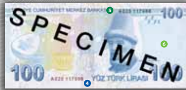
100 Turkish Lira (72x154 mm)