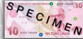
10 Turkish Lira (64x136 mm)