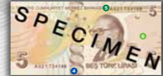
5 Turkish Lira (64x130 mm)