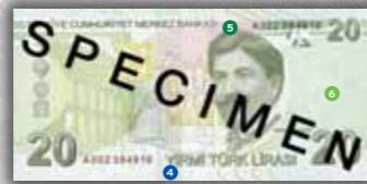
20 Turkish Lira (68x142 mm)