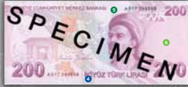
200 Turkish Lira (72x160 mm)